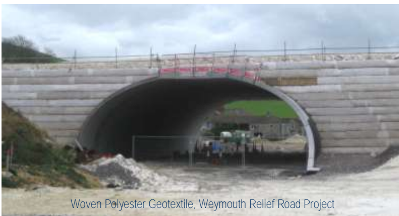
Woven Polyester Geotextile, Weymouth Relief Road Project